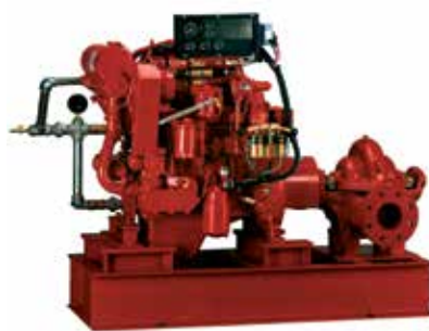
Models 481, 485, 491, 492, 495