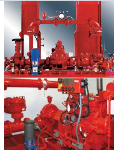
Pictured at top: Packaged Fire Pump System.

As an ISO 9001 registered company, Aurora Pump is committed to quality. In addition, to meet your time-critical requirements, Aurora offers the Red Hot quick ship program for total fire pump packages. Along with our outstanding customer service, Aurora will keep your fire pump system at peak performance for years to come. You can rely on Aurora Pump and our qualified distribution network to provide total pump solutions for fire protection.