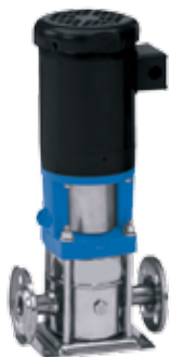
Models PVM & PVMX